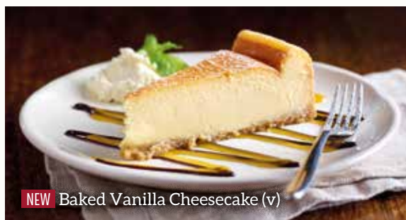
NEW Baked Vanilla Cheesecake (v)

New York Style baked vanilla cheesecake served with Belgian chocolate sauce and passion fruit coulis.