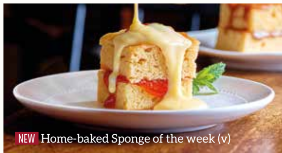
NEW Home-baked Sponge of the week (v)

Chocolate cake with a melted heart of raspberry filling served with a scoop of coconut milk sorbet.