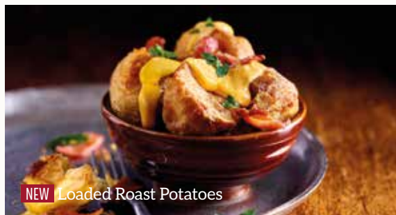
NEW Loaded Roast Potatoes